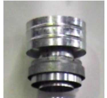
B Vent Cowl Part No: 556681