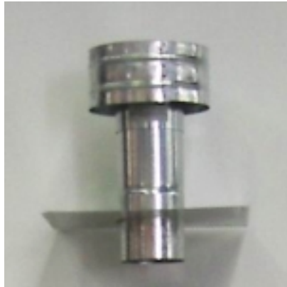
Chimney Flashing Plate and Cowl Kit Part No: 556682